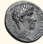
Actual image of a Roman coin!

Some of the leaders of the church tried to trick Jesus into saying something wrong. They said, "You know God is the ruler of the world. So is it right to pay taxes to the Emperor?"